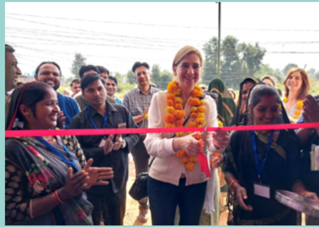
Inauguration of processing unit during the visit of "la Caixa" Foundation in November

Keeping the suggestions of the farmers in mind, the project team co-created a roadmap for setting up a Farmer Resource Centre in each district. One farmer in each district was nominated to lead the process of making accessible all types of agricultural facilities, including advanced varieties of fertilizers, seeds, pesticides, agricultural machinery, and welfare schemes run by the government, as well as services such as credit services through the BASANT Women Farmer Producer Company. This resource centre came about through a method of collaborative participation and co-creation with the community and will be operational for program participants in 55 villages. Furthermore, the centre will be monitored by trained youth to ensure the sale of products made by the farmers at reasonable rates.