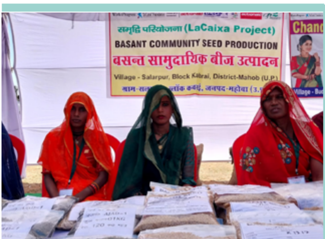
Women of BASANT FPO display their seed production in Mahoba

Keeping the suggestions of the farmers in mind, the project team co-created a roadmap for setting up a Farmer Resource Centre in each district. One farmer in each district was nominated to lead the process of making accessible all types of agricultural facilities, including advanced varieties of fertilizers, seeds, pesticides, agricultural machinery, and welfare schemes run by the government, as well as services such as credit services through the BASANT Women Farmer Producer Company. This resource centre came about through a method of collaborative participation and co-creation with the community and will be operational for program participants in 55 villages. Furthermore, the centre will be monitored by trained youth to ensure the sale of products made by the farmers at reasonable rates.