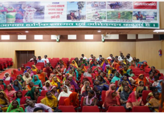
Women gather in large numbers at the Annual Convention

The first Annual Convention of Women Farmer Entrepreneurs was celebrated on 28th September 2022 at the Deen Dayal Upadhyaya Auditorium, Jhansi, where nearly 400 women from all the W4P programme districts of Jhansi, Mahoba and Lalitpur were present. This event aimed at showcasing the programme, the different farm based prototypes put in place and products such as besan (gram flour), dhaliya (porridge), haldi (turmeric), and dhania (coriander) that the women have been able to bring to the market and to local farming community. A booklet showcasing the program and the prototypes was also released at the event.