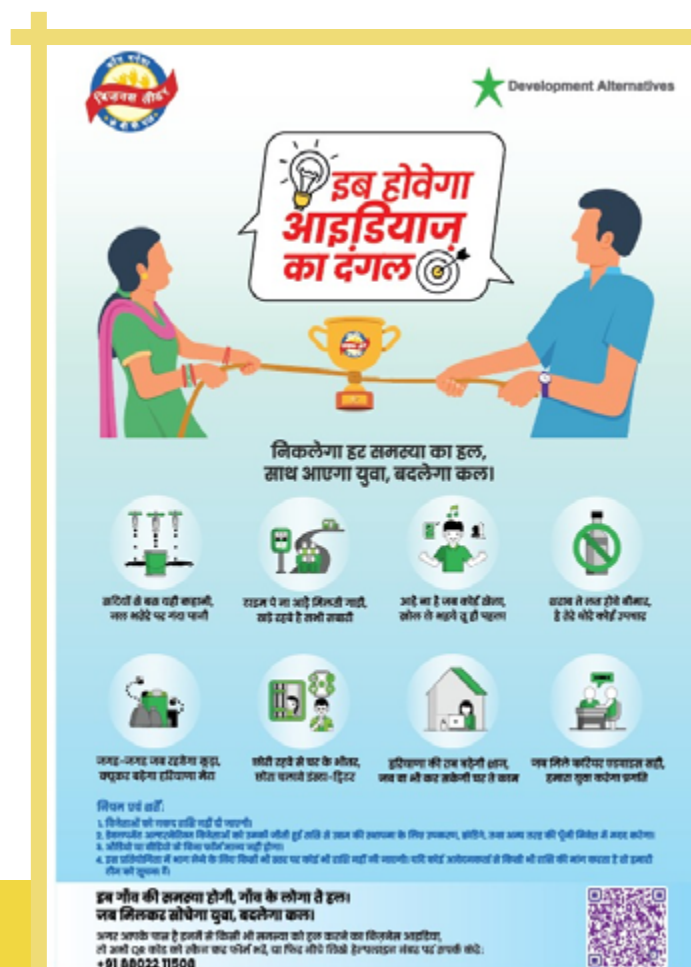
Poster of grassroots innovation challenge