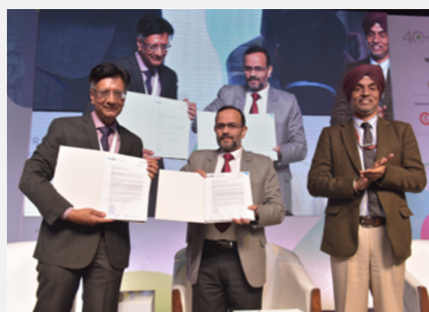
Launching the DA and SBI Foundation collaboration to accelerate entrepreneurship through social innovation