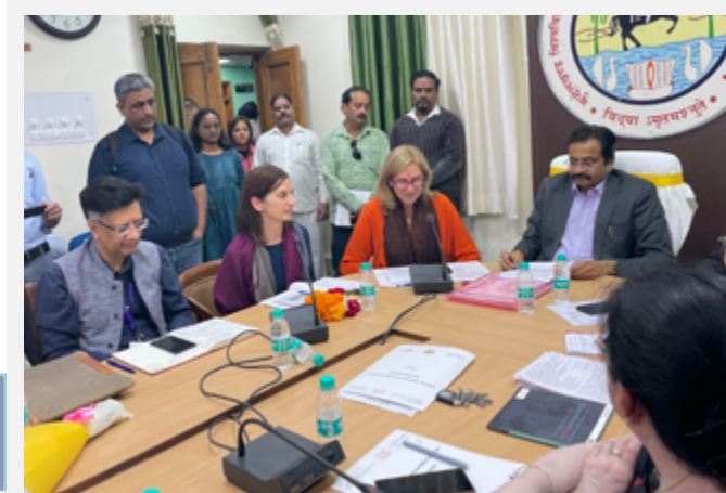
Bundelkhand University hosts the meeting of the District Enterprise Coalition

The visit to AAA’s geography in Bundelkhand was significant as women farmers gathered in large numbers to share their experience of adapting farm-based models in their small landholdings that has brought them better returns, a range of products for sale and a greater sense of solidarity as they became members of the BASANT Farmer Producer Organization. The concern for the environmental impact of chemical fertilizers and pesticides on the soil was evident in the shift being made to natural farming methods. Their presence also signified a shift in their position within the larger social space and the power of collectivization and solidarity.