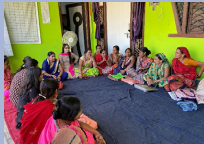
Rang De and DA team unearthing aspirations of women in Bankati, Basti

Innovation in the form of designing credit products suited to the needs of different entrepreneurs can enable aspiring women to take up entrepreneurship. Rang De, one of the core partners of the programme, has co-created three 'persona based' loan products with the community, with customised loan repayment and interest rates. Women entrepreneurs have the agency to choose how much they want to borrow, for how long and at what terms. The platform also enables first-time women borrowers' access to formal credit and helps them build a credit score thereby making financial inclusion possible for aspiring women entrepreneurs. For instance, for women entrepreneurs who aspire to set up technology powered enterprises, such as e-rickshaw, a loan product with seven per cent interest rate per annum has been introduced, with a repayment tenure of 18 months. In the last five years, the customisations has accelerated women entrepreneurship and enabled more than 1500 women to set up micro-enterprises, creating 3200+ jobs.